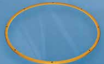
PLASMA RESISTANT SHIMS

Fralock technology provides a solution that merges the fluorine plasma erosion protection qualities of a PTFE or PFA (Teflon) protective film over more rigid polymer shims and gaskets manufactured using a Kapton polymer material. Fluorinated plasmas can erode polymer shims and gaskets quickly, significantly reducing the Mean Time Between Clean (MTBC), increasing tool downtime, and escalating replacement costs. Fully encapsulated shims and gaskets allow all surfaces and features to be precisely controlled and protected, including thru holes and alignment slots. Increase MTBC, increase uptime, and reduce maintenance costs.