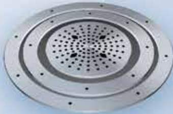
SHOWER HEAD GASKETS

Fralock has several superior material choices for showerhead manufacturability, providing uniform thickness and excellent thermal performance as thin as 0.006". The showerhead gas delivery mechanism uniformly dispenses reactant gases over a secondary surface or wafer. A constant temperature across the surface of the showerhead during processing is critical in preventing deposition reactions that can clog up the pores, or holes, in the showerhead, possibly disrupting uniform gas delivery and jeopardizing wafer yield. Choosing the right material for a showerhead gasket is critical for thermal management and thickness uniformity to maintain a consistent electrode gap between the showerhead and the secondary surface. When you need the right showerhead gasket material manufactured, let Fralock be your solution provider.