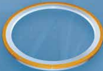
EDGE RING SUB-ASSEMBLIES

Fralock's Thermal Interface Solutions include materials that allow heat to pass through the Z-axis efficiently, spread heat effectively through the X-Y axis, or prevent heat from passing through from one surface to another. Fralock utilizes its advanced materials and manufacturing techniques to work directly with OEM's and assist with material selection to provide thermal interface solutions to improve tool effectiveness. Fralock has high thermally conductive silicone rubber gap fillers (with TC-Z surface as high as 17 W/m·K) available as thin as 0.3mm, or effective thermal spreaders to assure uniform heat dispersion across an entire surface (with TC-XY surface >200 W/m·K), or Fralock's own Cirlex® to create a thermal break between two surfaces. Fralock has what you need.