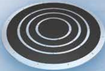
THERMAL INTERFACE SOLUTIONS

Fralock has several superior material choices for showerhead manufacturability, providing uniform thickness and excellent thermal performance as thin as 0.006". The showerhead gas delivery mechanism uniformly dispenses reactant gases over a secondary surface or wafer. A constant temperature across the surface of the showerhead during processing is critical in preventing deposition reactions that can clog up the pores, or holes, in the showerhead, possibly disrupting uniform gas delivery and jeopardizing wafer yield. Choosing the right material for a showerhead gasket is critical for thermal management and thickness uniformity to maintain a consistent electrode gap between the showerhead and the secondary surface. When you need the right showerhead gasket material manufactured, let Fralock be your solution provider.