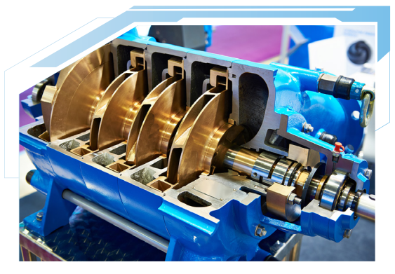
MULTI-STAGE CENTRIFUGAL PUMP

Packaging, laser insulators, X-ray tubes, fluid bearings, firing trays, pressure reduction devices, wear resistant pumps, molten glass pumps, mass spectrometers, high voltage insulators, thermal energy storage