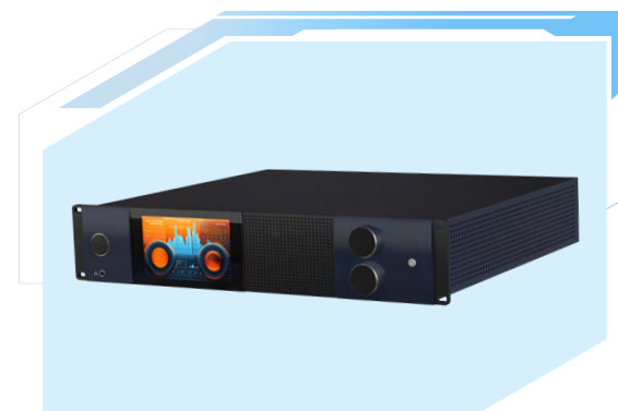
Multi-Channel Audio Interface