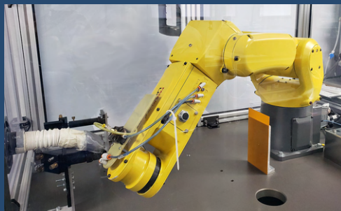
Custom Automated Equipment