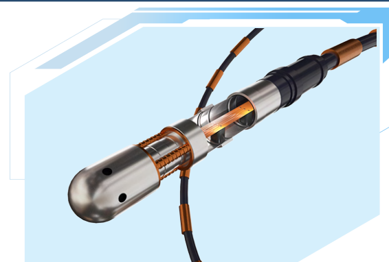
Tissue Ablation Catheter

When it comes to industrial, medical, aerospace, military, and defense markets, precision assembly is crucial. Fralock is your trusted partner, offering advanced capabilities to produce assemblies that satisfy your unique requirements. Our commitment to quality, automation, and customer satisfaction is what sets us apart.