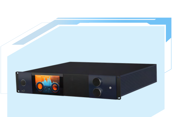
Multi-Channel Audio Interface

When it comes to industrial, medical, aerospace, military, and defense markets, precision assembly is crucial. Fralock is your trusted partner, offering advanced capabilities to produce assemblies that satisfy your unique requirements. Our commitment to quality, automation, and customer satisfaction is what sets us apart.